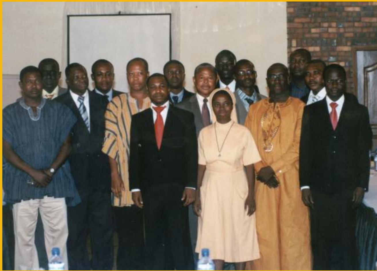
The Governing Council and the Executive Board