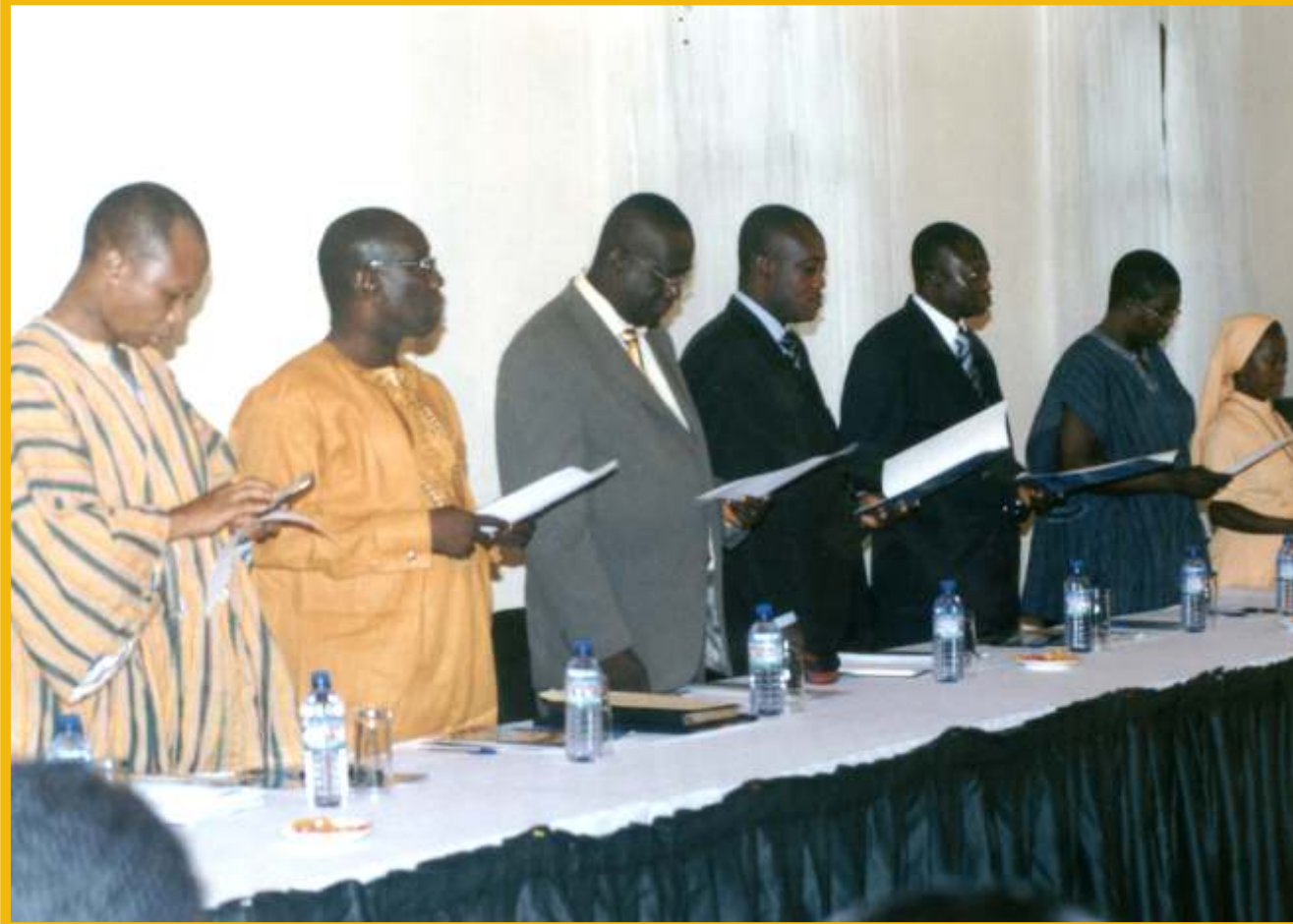
Swearing in of the Governing Council by the Association's Lawyer