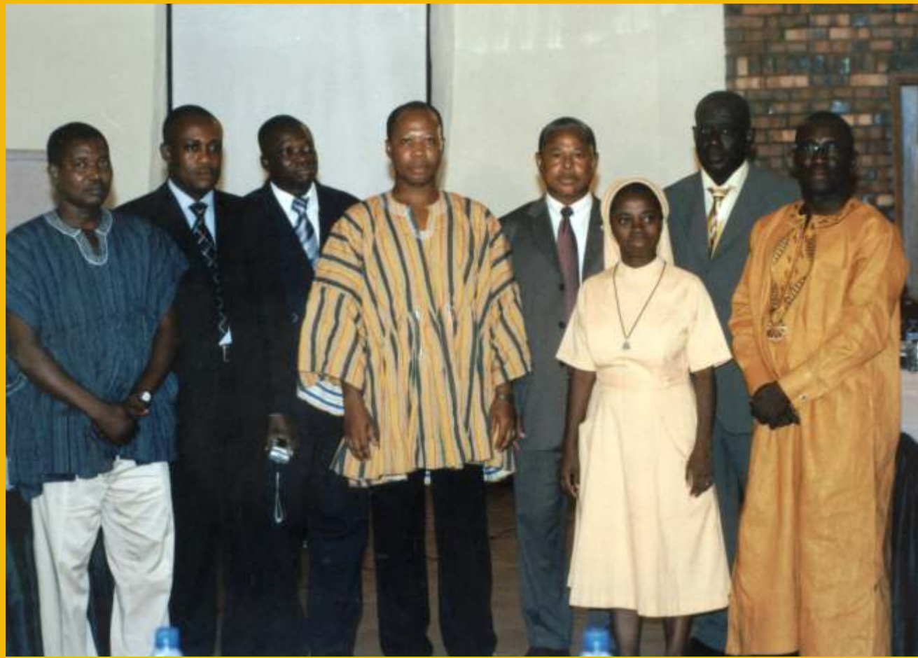
Governing Council members present during the Inaugural Ceremony