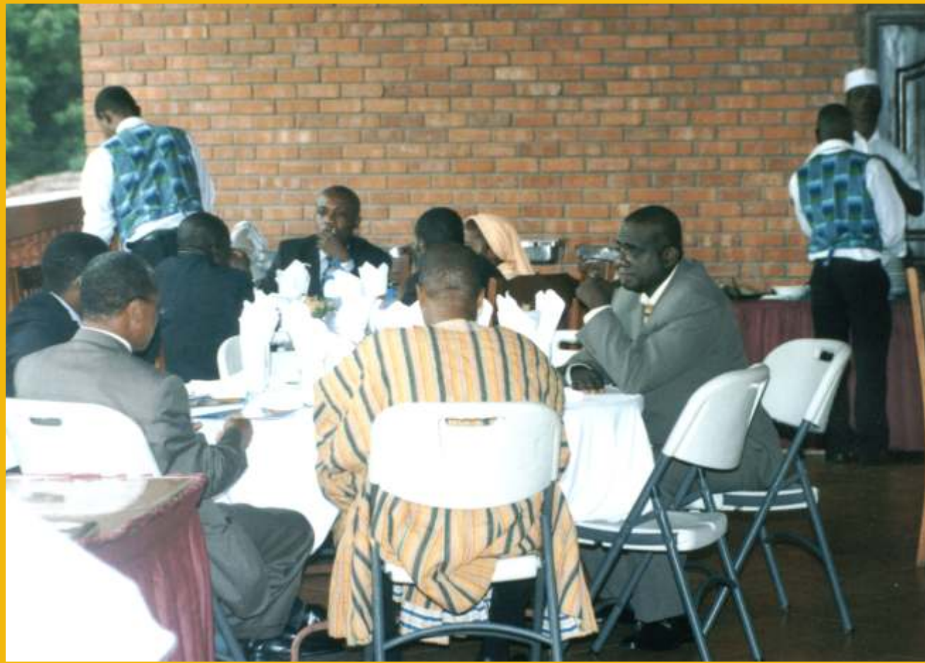
Cross section of members during Lunch