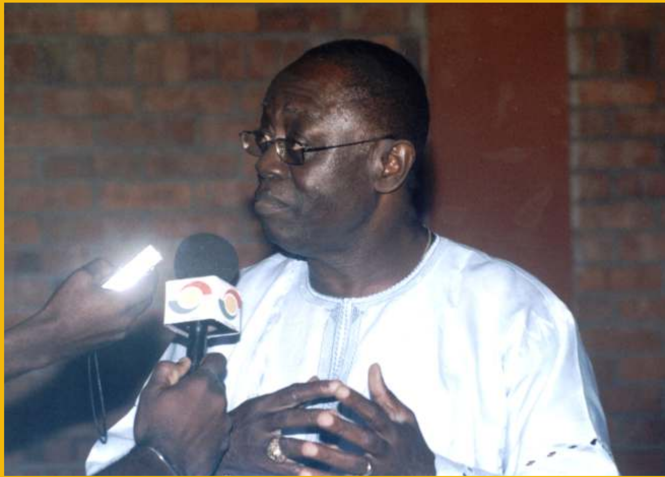
The Chairman of the occasion being interviewed by the Television station after the Inaugural Ceremony