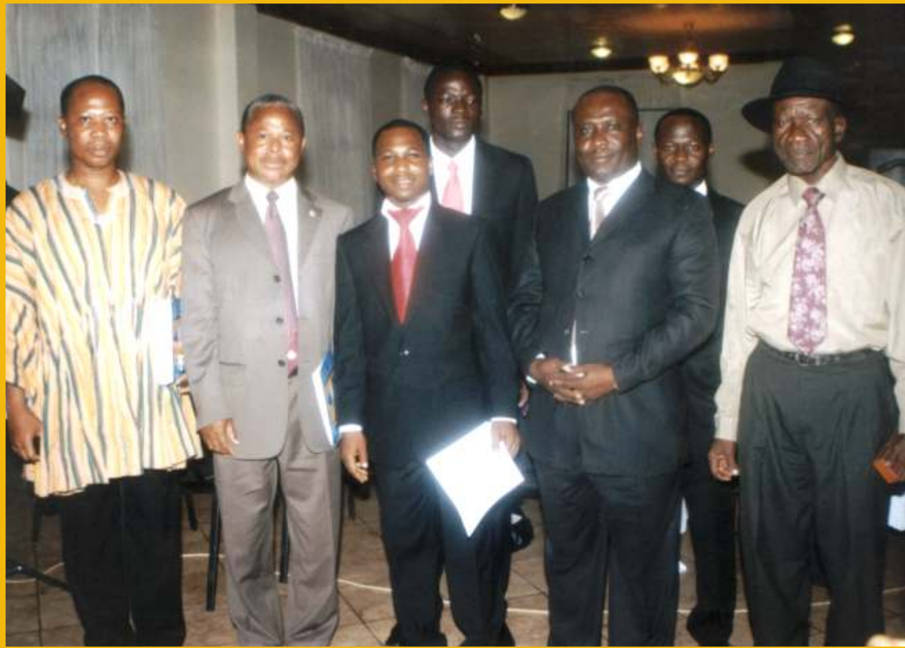
Governing Council members interact with Executives of ACCE